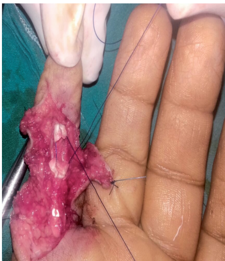
Fig. (1): Two strand tendon repair (modified Kessler) in little finger.

operative range of motion of DIP, PIP joints flexion range of motion and Total Active Movement (TAM) of the injured fingers.