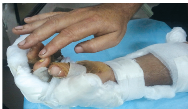
Fig. (3): Post -operative physiotherapy (passive flexion exercises).