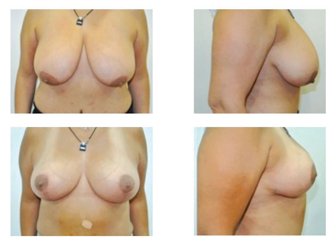
Fig. (5): Bilateral reduction mammaplasty using superior pedicle for NAC and central pedicle for auto-augmentation. Inverted T skin closure pattern.