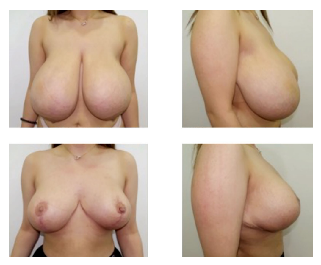
Fig. (4): Bilateral reduction mammaplasty using an inferior pedicle and inverted T skin closure pattern.