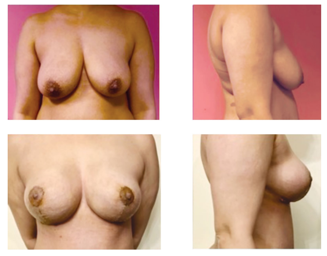
Fig. (3): Bilateral reduction mammaplasty using the supero-medial pedicle and inverted T skin closure pattern.