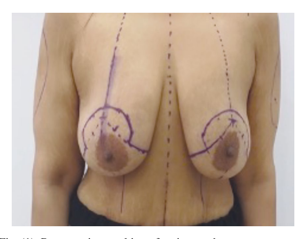
Fig. (1): Preoperative marking of patient underwent mastopexy.

The objective assessment curve was applied to the curve of objective assessment regarding one item; N/IMF distance and was shown in Fig. (6).