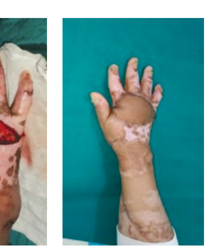
Fig. (17): Postoperative.