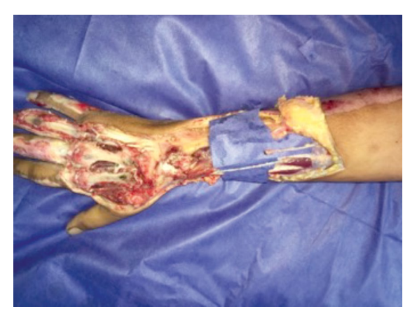
Fig. (9): Vessels in the recipient site.