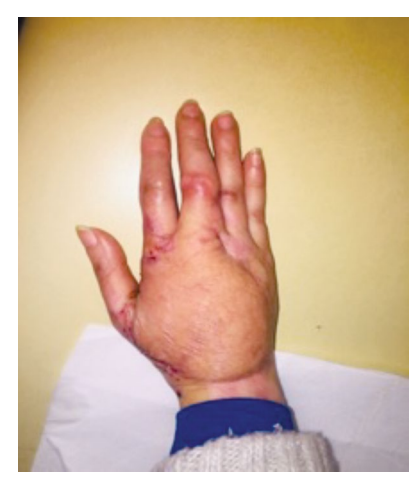
Fig. (14): Postoperative.