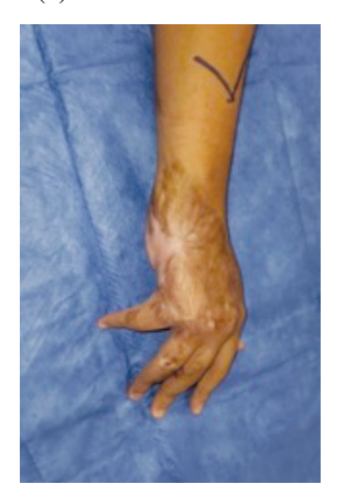
Fig. (18): Preoperative.