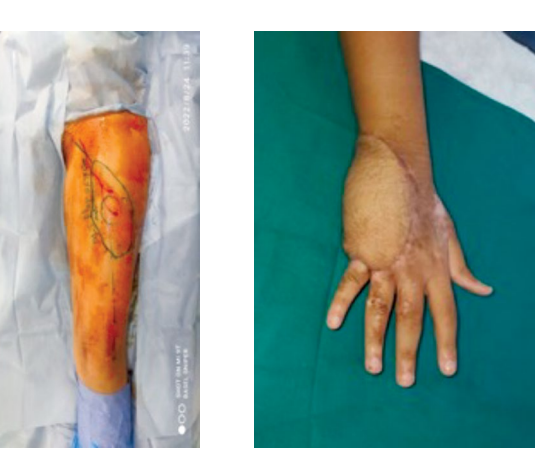
Fig. (20): Postoperative.