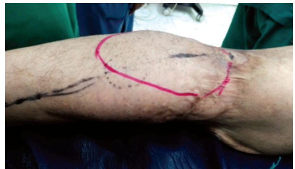
Case (2): Preoperative and design.