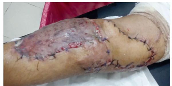
Case (2): Early postoperative.