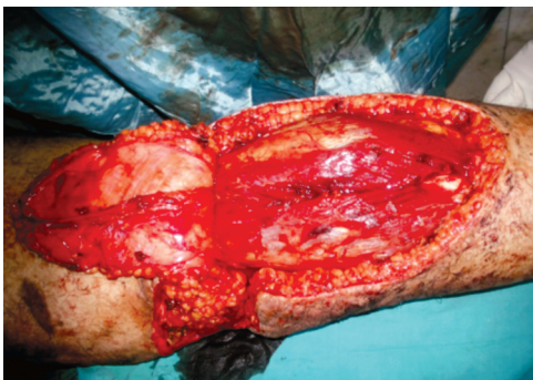
Case (4): Intraoperative.