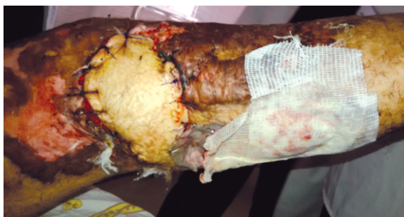
Case (1): Early postoperative.