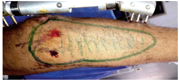
Case (5): Postoperative