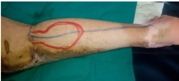
Case (4): Preoperative and design.