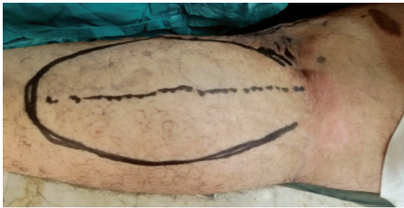
Case (3): Preoperative and design.