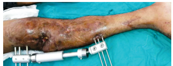
Case (5): Early postoperative.