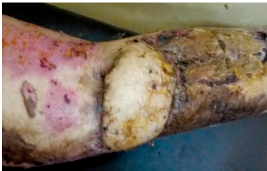
Case (4): Postoperative.