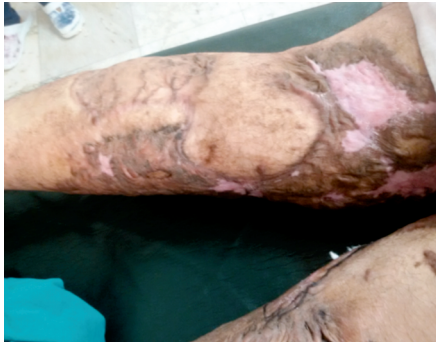
Case (3): Late postoperative.