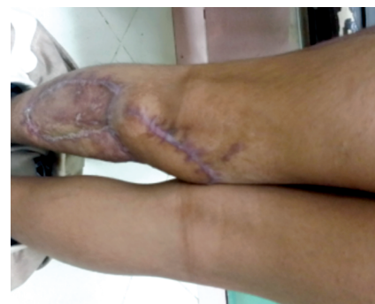
Case (2): Late postoperative.