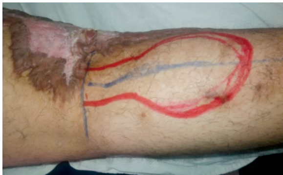
Case (1): Preoperative and design.