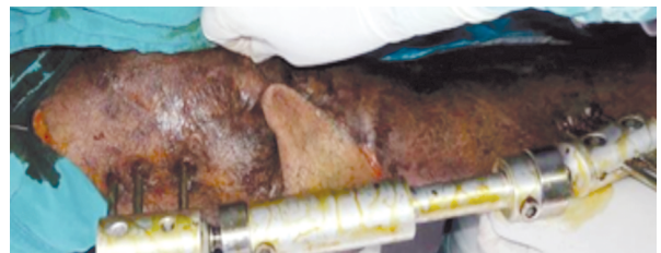
Case (5): Intraoperative.