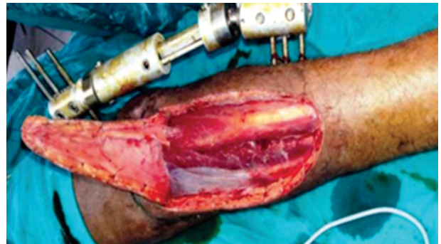
Case (5): Preoperative.