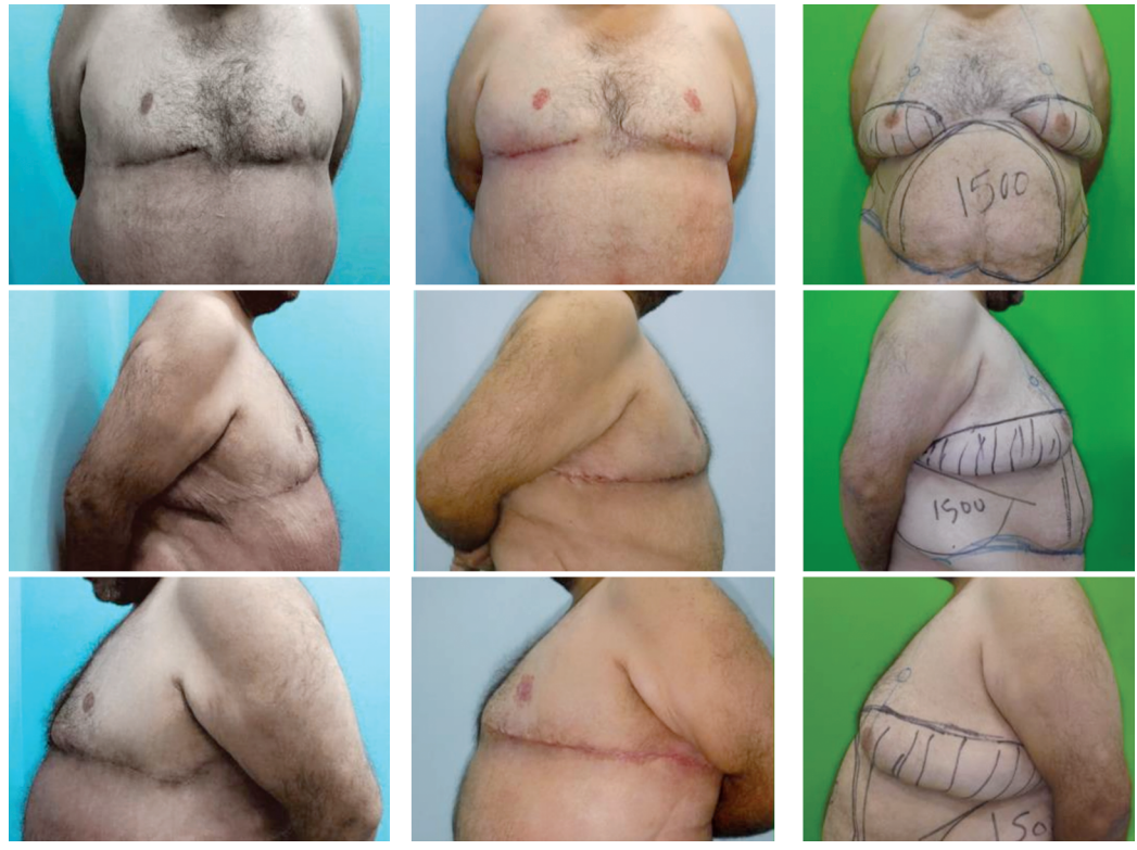
Fig. (3): Pre-operative and post-operative views of a 47 years old patient.