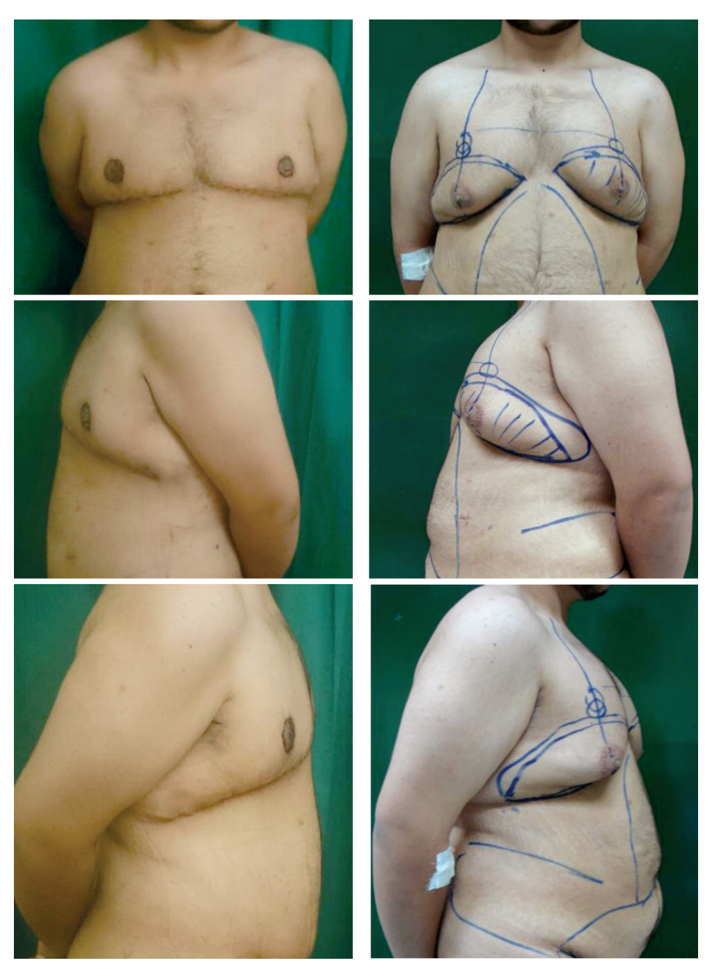
Fig. (4): Pre-operative and post-operative views of a 29 years old patient.