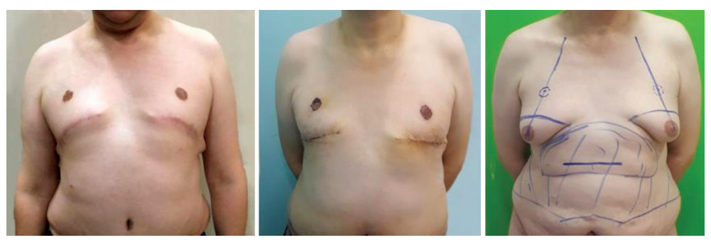
Fig. (5): Partial loss and pigment changes of the right NAC.