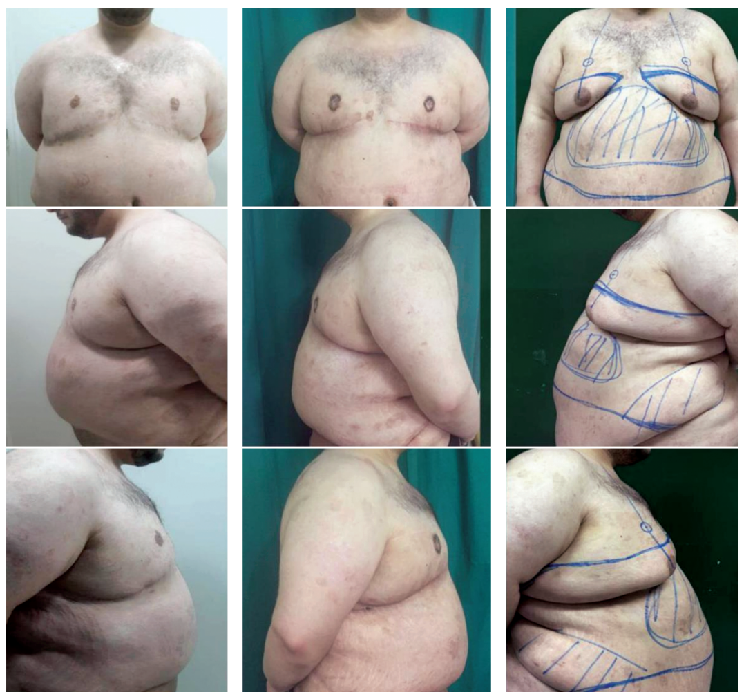
Fig. (2): Pre-operative and post-operative views of a 36 years old patient.