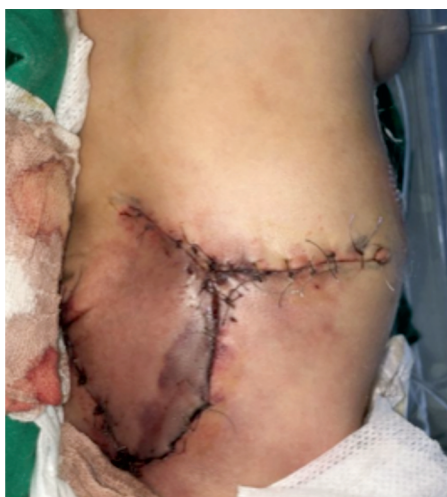
Fig. (3): Follow-up (first five days) was done for flap congestion (arrow), ischemia, partial or total flap loss, wound dehiscence and infection.

however, the three flaps healed eventually by secondary intension. and they were managed by removing some sutures at the distal end of the flaps. Two flaps (6.7%) showed wound dehiscence at the junction between the flap and its donor site, and they were managed conservatively by frequent dressings. There was no flap ischemia, total flap loss or CSF leakage. Up to two years of follow-up (Fig. 4), none of the cases developed ulcers or pressure sores at the flap site, and no cases required additional surgical procedures.