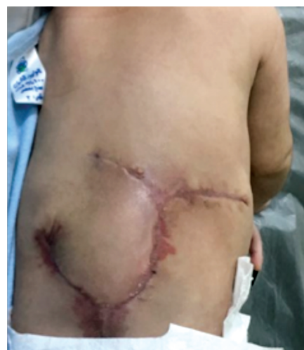
Fig. (4): Follow-up till complete healing.