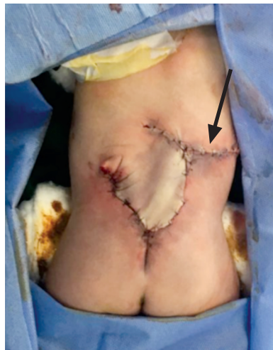
Fig. (2): The flap was dissected then rotated and sutured onto the defect with donor site closed primarily (arrow).